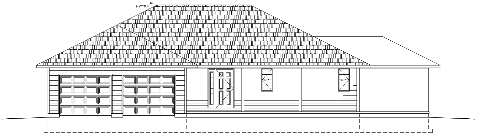
FRONT ELEVATION A-1 SCALE: 1/4"=1'-0"